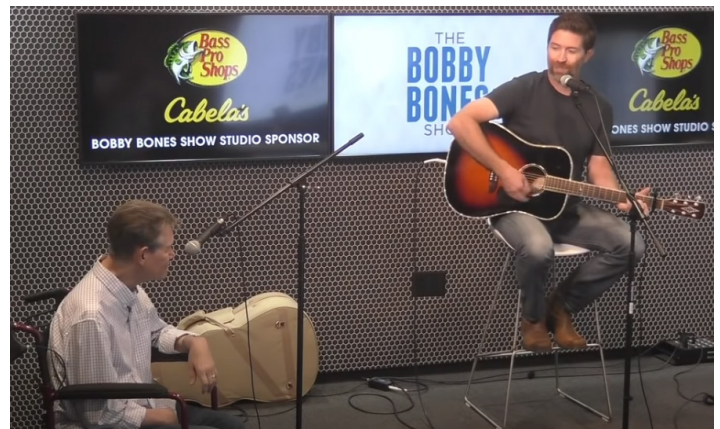
Josh Turner (right) performed "Forever and Ever, Amen" with an assist from Randy Travis on an edition of iHeartMedia's syndicated program The Bobby Bones Show .