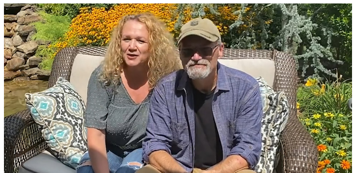
John Berry and his wife, Robin Berry, took part in an edition of Circle Sessions at Home on Aug. 19 on Circle TV.

Source: RolandNote.com , the Ultimate Country Music Database